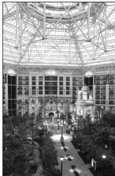
Atrium of the Gaylord Texan Resort & Convention Center

Additional shopping and entertainment are nearby. The city of Dallas itself with