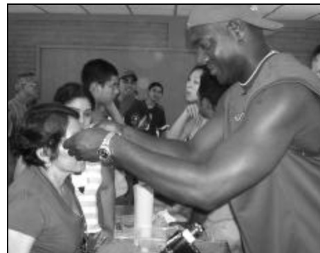
Chicago White Sox pitcher Jose Contreras happily pitched in during a VOSH-Northeast clinic near Masaya last year. The baseball star and the VOSHers met when both were staying at the same nearby hotel.

from 45 to 85 volunteers and include a number of optometry students, mostly from the State University of New York (SUNY) School of Optometry and the Hogeschool Van Utrecht School of Optometry (Netherlands). Services offered