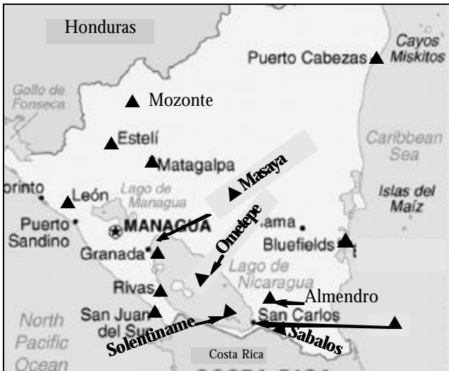
▲ Triangles mark VOSH clinic sites