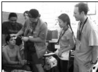
Treating a patient in San Juan del Sur.